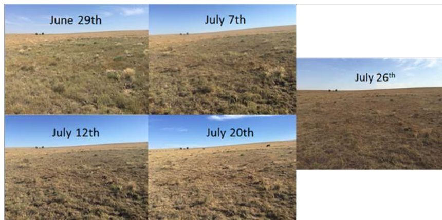
Above: Range Conditions in South throughout herd occupancy.