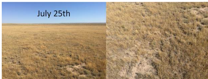
Above: Range conditions in Crossroads. Landscape (left) and Close-up (right).

On behalf of the USDA-ARS-Rangeland Resources Research Unit, I thank you all for your continued participation in this project.